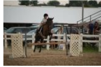
Above: Junior Member with her RMHA horse competing at local horse event.