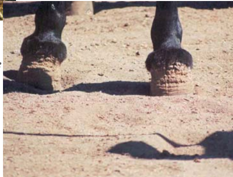
Feet of a victim of prolonged chemical soring. This view was taken after two years of post soring rehabilitation. The horn is almost completely disfigured. The horse is lucky to be standing.

the metal through living tissue. Unfortunately, cheaters know that fluoroscopes are not yet in common use and that there are still plenty of ways to get through the DQP exams undetected. At one show, it was discovered that screws were inserted into the hoof wall