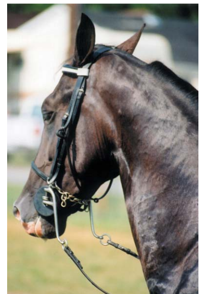
Harsh, long shanked bits are common at shows in which padded or “Big Lick” classes are held.

A FORMER INSIDER describes a typical scene. “The first thing you might notice about a sore horse barn is a strange smell. That is, if you're not distracted by a smooth talking barn employee or just run off altogether. Though the barn might have a “public area” much