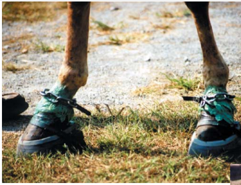
Big shoes, long toes, exaggerated angles, chains and chemical soring agents all combine to alter the gait of the horse. Note the fine cannon bones of this young animal.

too much, can leave a horse lame, unmanageable, sick, colicky or worse. "Not surprisingly," one industry insider confides, "many sored show horses, if they live through the "training/stewarding" phase of their lives, wind up with severe, often fatal colic between the ages of 10-12." But despite all this, there are still those who believe the ribbons are worth the risks.