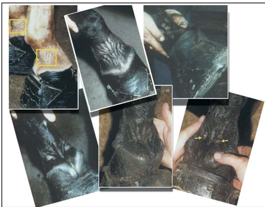
From the USDA handbook, Understanding the Scar Rule