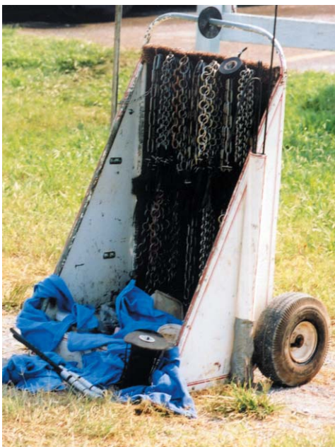
A common sight at some shows, a vast and varied assortment of chains for each trainer.

A former sore horse exhibitor confesses, "I used to show in the sore horse world and have recently "changed over". I just couldn't tolerate another day of seeing what goes on. I actually left a large Championship show last year after seeing a horse I had shown amateur (and loved) so sore he could barely walk on his own. This horse was turned down and not