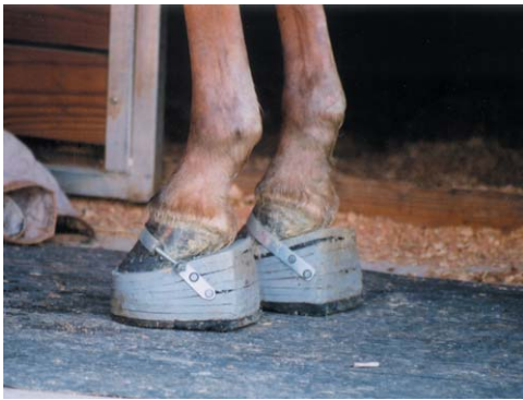
Note the unnatural angles and long toes. In some instances, the bands used to hold on the big shoes have been used to hide screws underneath.

plastic wrap covered with leg wraps to let it “cook”, usually overnight. Exposure can cause convulsion, muscle contractions, gastrointestinal changes, rapid heartbeat to heart attack, fertility problems and fetal death. In people, a good whiff can cause coughing, pulmonary edema, headache, nausea, vomiting and worsen asthma. When a package of mustard oil was accidentally dropped in a post office, after having been illegally mailed by a trainer to farm, the building had to be evacuated and postal employees hospitalized.